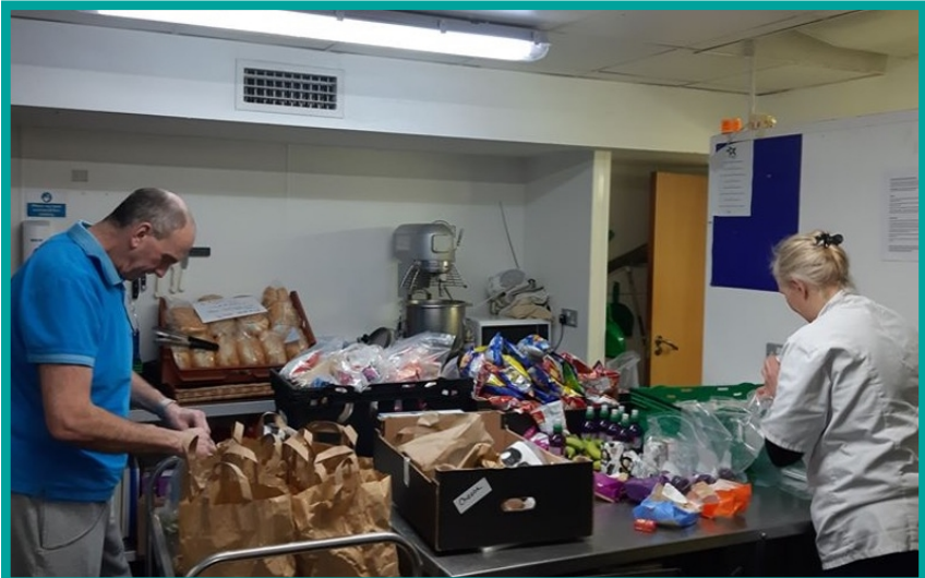
2700 Lunch packs for the homeless, P4