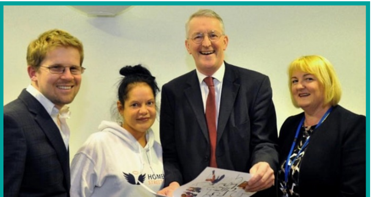
The homeless charter launch event