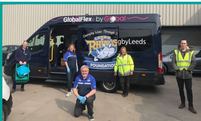
Distributing food across West Yorkshire, P5