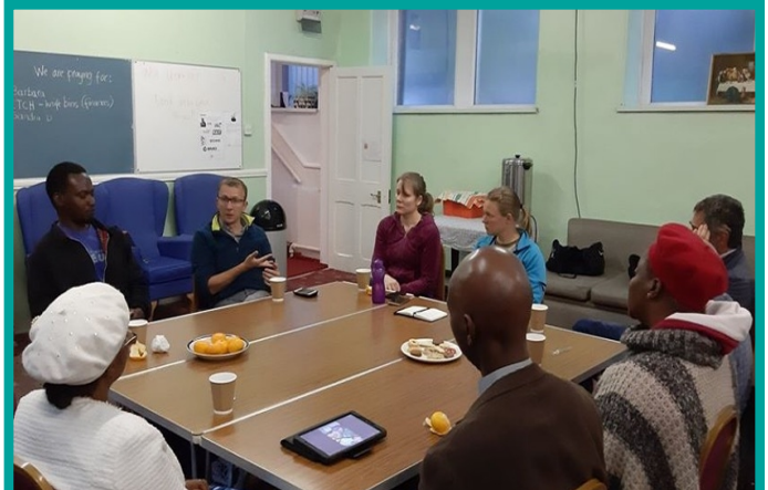
Discipleship on the margins, P8

Trust in the Lord with all your heart (Proverbs 3:5)