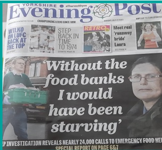
890 food parcels delivered, P3