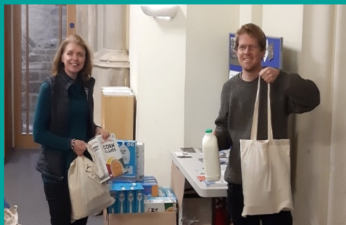
4300 meals working with Gateway Church, P7