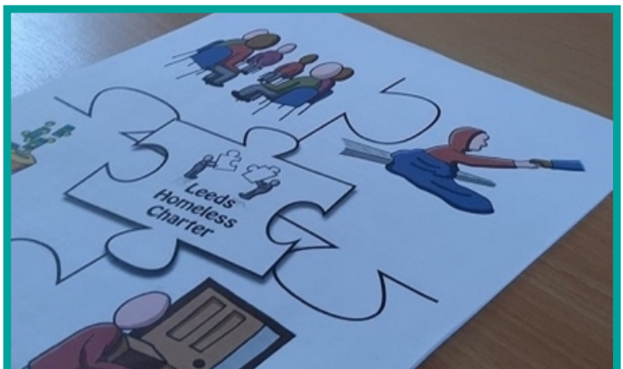
Homeless coordination support (Charter Launch), P6